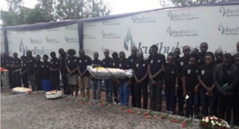
Bamwe mu rubyiruko rwo mu Ntara y'Amajyepfo bunamira Abatutsi bazize Jenoside basaga 250000 bashyinguye ku rwibutso rwa jenoside rwa Kigali ku Gisozi

Nyuma yo gusura urwibutso rwa Jenoside rwa Kigali ku Gisozi ndetse n'Ingoro y'Amateka y'urugamba rwo guhagarika Jenoside, kuwa kane tariki 21 Gashyantare 2019, urubyiruko rugera kuri 600 rwaturutse mu Ntara y'Amajyepfo rwanenze abari urubyiruko bagize uruhare muri Jenoside yakorewe Abatutsi mu 1994 banashima urundi rwayihagaritse.