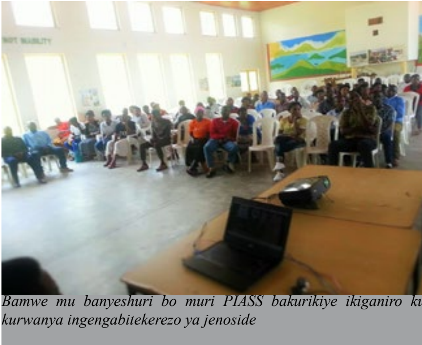
Bamwe mu banyeshuri bo muri PIASS bakurikiye ikiganiro ku kurwanya ingengabitekerezo ya jenoside

N ibura abanyeshuri 80 biga muri hahunda y'impera z'icyumweru mu ishuri ry'Abaporotesitanti ry'Ubugeni n'imbonezamubano (Protestant Institute of Arts and Social Sciences ,PIASS), ishami rya Karongi basabwe kugira uruhare mu bikorwa byo kwibuka ku nshuro ya 25 Jenoside yakorewe Abatutsi.