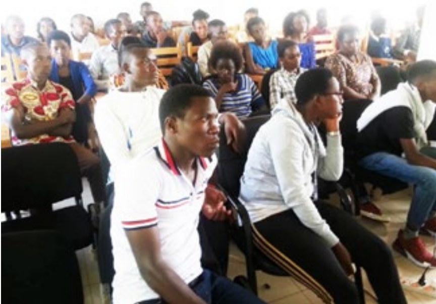
Abanyeshuri bo muri Kayonza CIP bakurikira ikiganiro

A banyeshuri bo mu ishuri rikuru ry'ubumenyingingiro, Kayonza Community Integrated Polytechnic basabwe kubera abandi urugero rwiza bitabira ibikorwa byo kwibuka ku nshuro ya 25 Jenoside yakorewe Abatutsi.