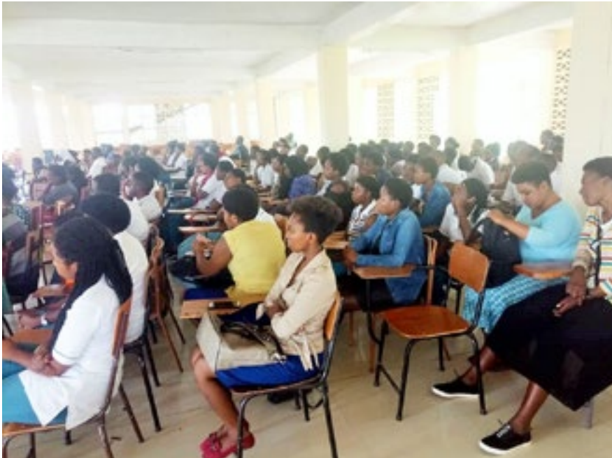
Abanyeshuri bo muri Kaminuza ya Gitwe bakurikira ikiganiro ku kurwanya ingengabitekerezo ya jenoside

Urubyiruko rwasabwe kubaka amateka mashya y'ubumwe, ubwiyunge no kwigira mu rwego rwo gukosora amateka mabi yasizwe n'urubyiruko bagenzi babo bagize uruhare mu gukora Jenoside yakorewe Abatutsi.