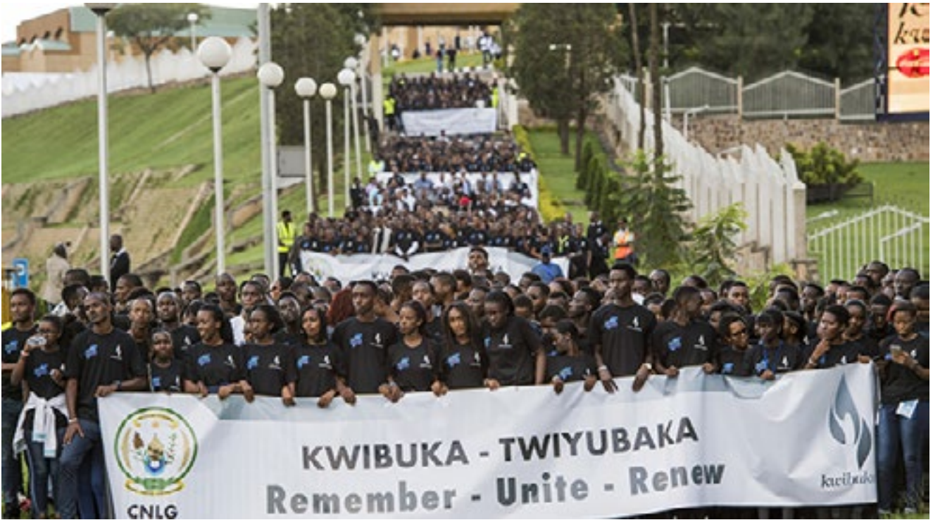
Abanyarwanda mu rugendo rwo kwibuka (Walk to Remember) Jenoside yakorewe Abatutsi. Gutanga imbunda ku mitwe yitwara gisirikare no kubasivili ni kimwe mu bikorwa byabanjirije ishyirwa mu bikorwa ryayo

Nk'uko bigaragazwa mu bushakashatsi bwakozwe na Komisiyo y'Igihugu yo Kurwanya Jenoside (CNLG) ku mateka ya Jenoside yakorewe Abatutsi mu yahoze ari perefegitura ya Ruhengeri, nyuma yo guhabwa imyitozo, abatojwe mu mitwe yitwaraga gisirikare bagombaga no guhabwa intwaro.