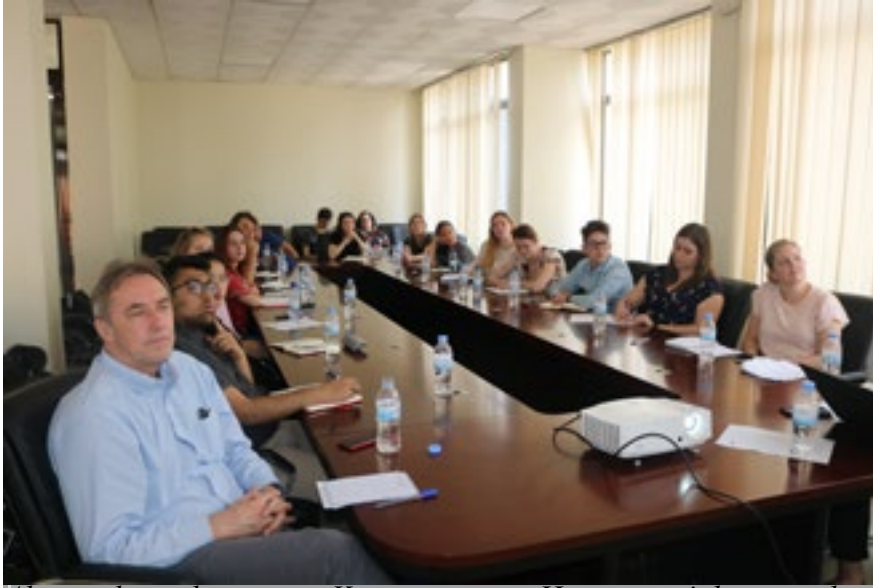
Abanyeshuri bo muri Kaminuza ya Huron n'abarimu bari babaherekeje bakurikira ikiganiro

Kuwa kabiri tariki 19 Gashyantare 2019, abanyeshuri 17 bo muri Huron University College, University of Western Ontario muri Kanada, baherekejwe n'abarimu babo babiri basuye Komisiyo y'igihugu yo Kurwanya Jenoside (CNLG).