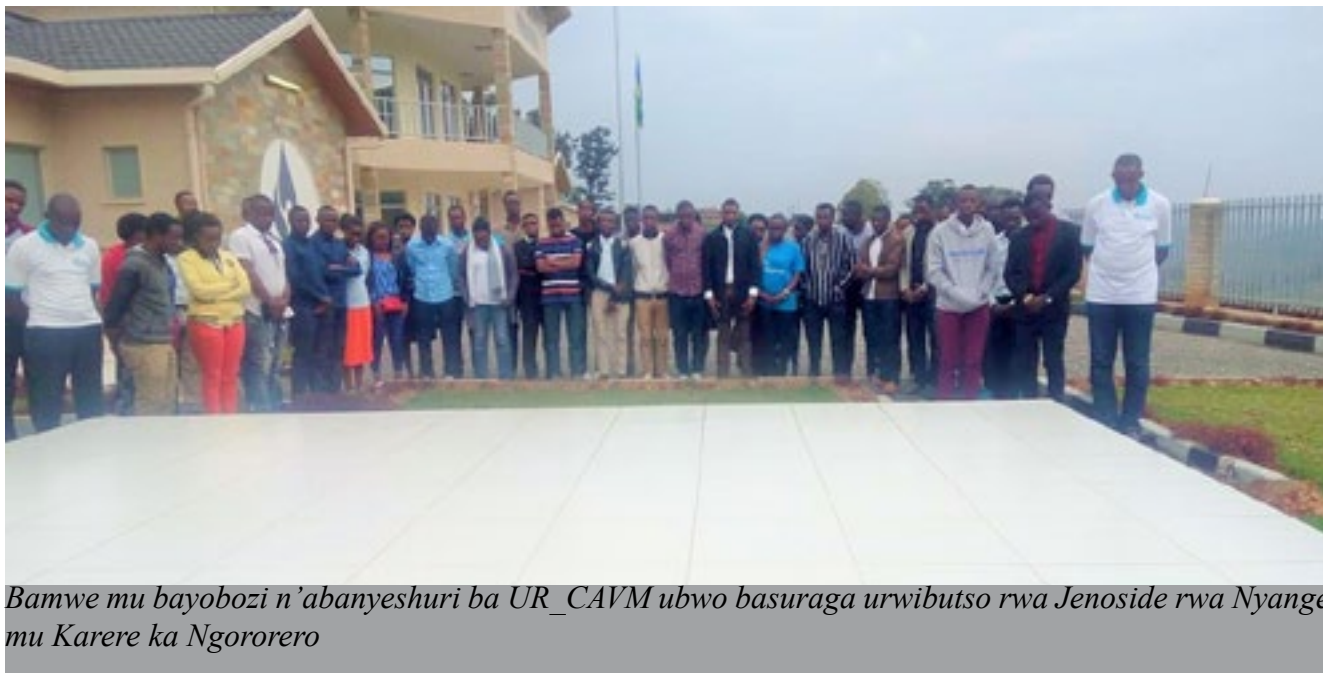
Bamwe mu bayobozi n'abanyeshuri ba UR_CAVM ubwo basuraga urwibutso rwa Jenoside rwa Nyange mu Karere ka Ngororero

Kuwa gatandatu tariki ya K02 Gashyantare 2019, abanyeshuri 45 bo muri Kaminuza y'u Rwanda, Koleji y'ubuhinzi n'ubuvuzi bw'amatungo (College of Agriculture and Veterinary Medicine, CAVM), ishami rya Busogo bari kumwe n'abayobozi babo bane basuye urwibutso rwa Jenoside rwa Nyange mu Karere ka Ngororero.