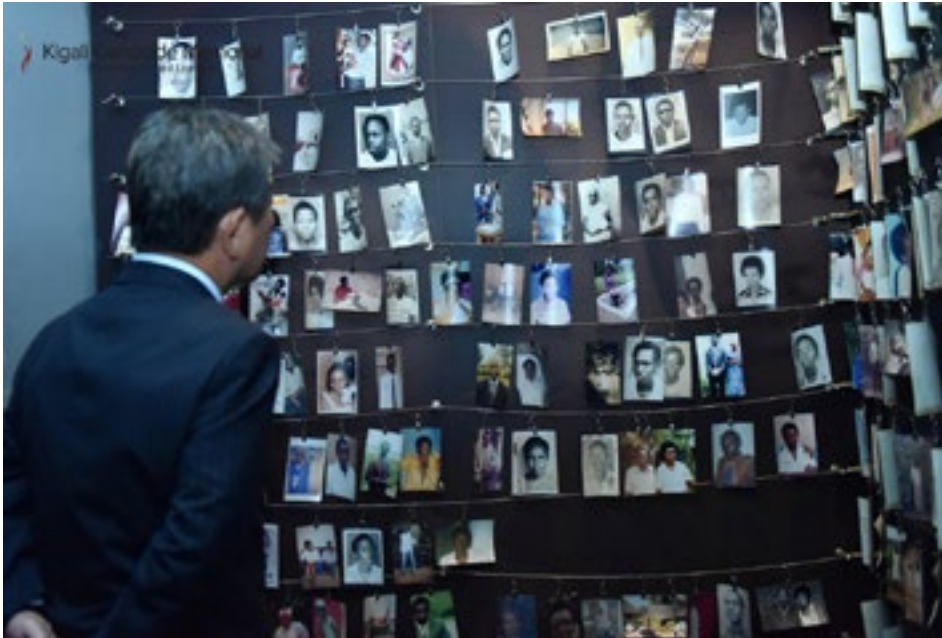
Umushyitsi ku rwibutso rwa Jenocide rwa Kigali ku Gisozi areba amafoto ya bamwe mu bazize Jenocide yakorewe Abatutsi